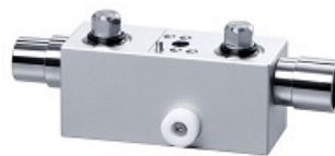
Selectatec with ISO 23mm